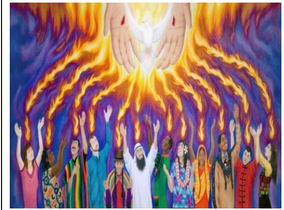
The Day of Pentecost