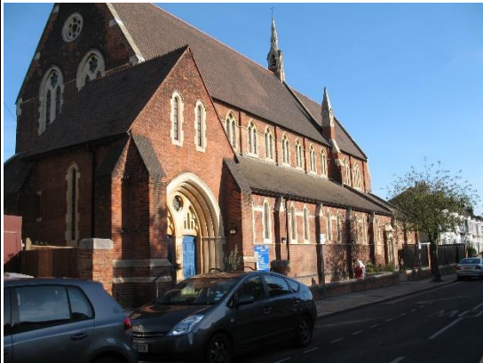
St Martin's Church - A Local Parish