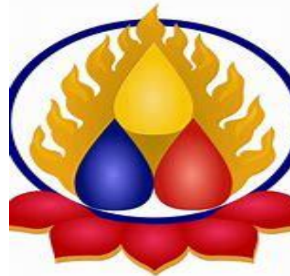
The three jewels