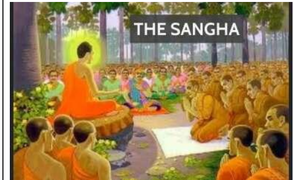
Sangha (Buddhist community)