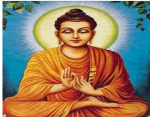
Image of the Buddha , known in life as Siddhartha Gautama