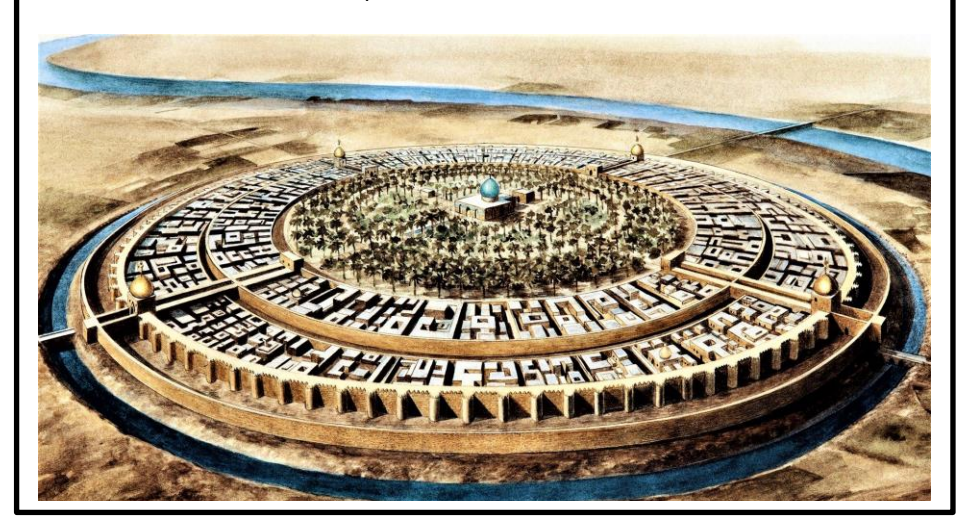
Examples of Islamic Art