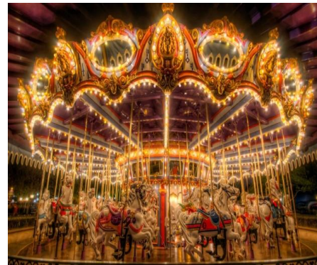
Carousel at a theme park (above)