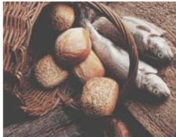
Jesus feeds 5000 people

miracle faith ministry believe Gospel magic pilgrimage resurrection bibliodrama hope mustard seed 'People of God,' candle