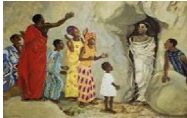
The raising of Lazarus