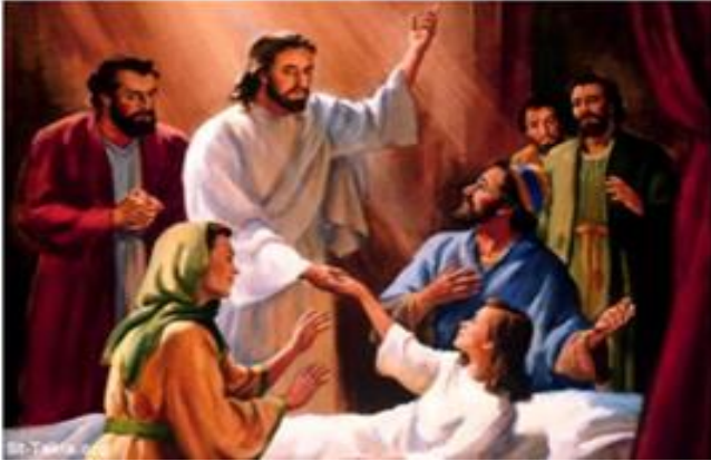
Jesus heals Jairus' daughter

Assessment Question: What do the Miracles teach us about Jesus?