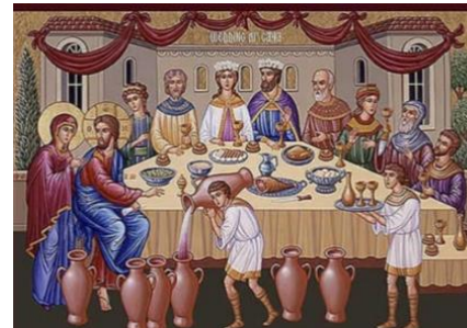
Jesus turns water into wine