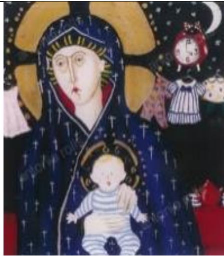
Title: 4am Madonna (1994) Artist: Antonia Rolls Origin: United Kingdom