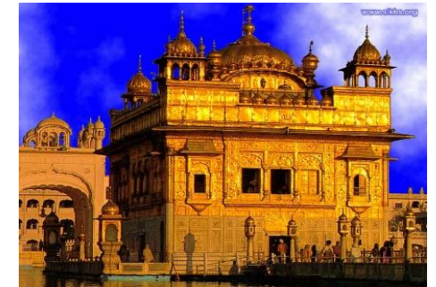
Mandir Sahib The holiest shrine for Sikhs