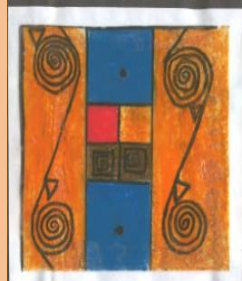
Drawing based on the work of Hundertwasser.