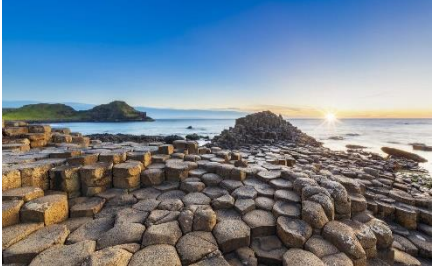
Giants Causeway-Northern Ireland