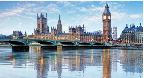
Houses of Parliament- England