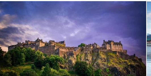
Edinburgh Castle- Scotland