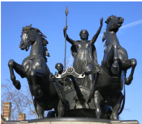
A statue of Boudicca, leader of the Iceni tribe who rose up against the Roman army in 61 CE.

Who was Boudicca and why do we remember her?