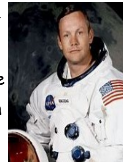
Neil Armstrong 1930—2012 First man on the moon.