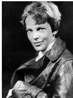
Amelia Earhart 1897—1937 Flew across the Atlantic Ocean