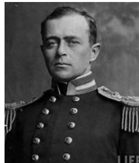
Captain Scott 1868—1912 Explored Antarctica