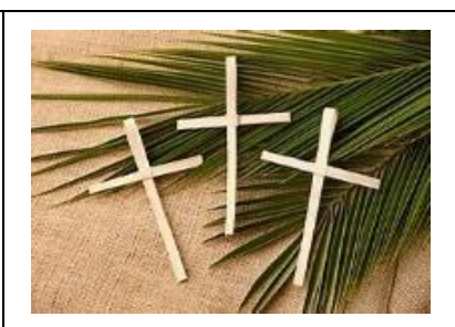
Articles for Palm Sunday