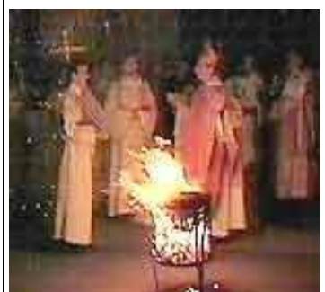
Good Friday The crucifixion of Jesus