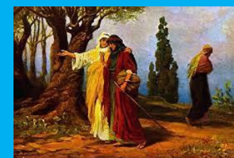
Ruth and Naomi