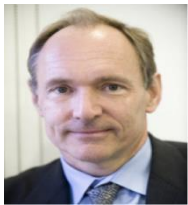
Tim Berners Lee