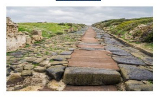
The Romans were excellent engineers and built roads across the empire.