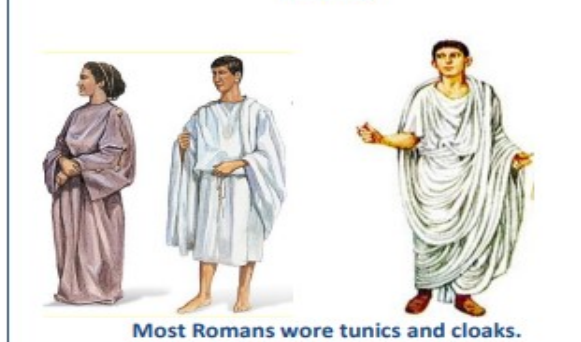
Only rich, male Roman citizens were allowed to wear a toga (draped linen).

55 BC- Julius Caesar's first attempt to invade Britain.