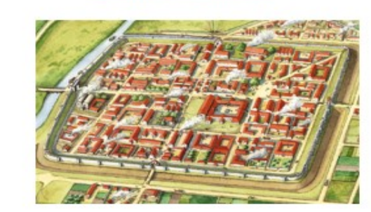
Roman towns were all built using an grid system.