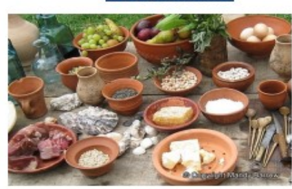
The Romans ate a breakfast of bread or a wheat pancake eaten with dates and honey. At midday they ate a light meal of fish , cold meat , bread and vegetables .