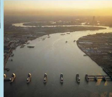
It is a set of gates that lie in the water across the river, which stop the tides from the sea affecting the river.

Assessment Question: How has London developed around the River Thames over time?