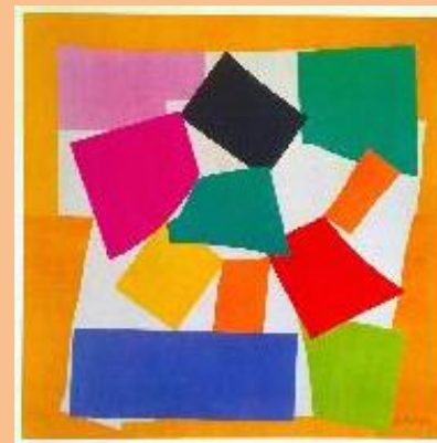
Henri Matisse - The snail